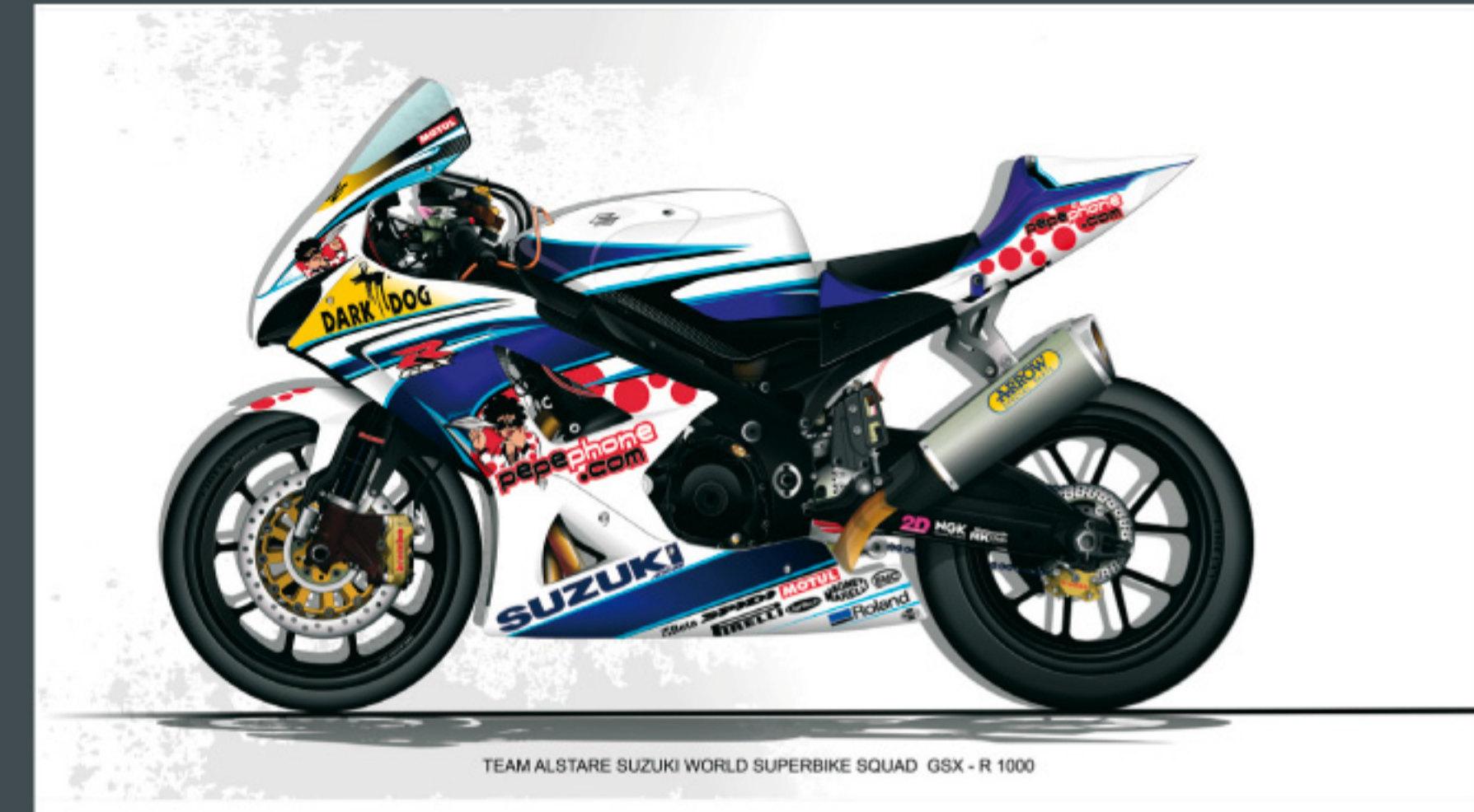
TEAM ALSTARE SUZUKI WORLD SUPERBIKE SQUAD GSX - R 1000

The VersaCAMM VPI series is available in two models: the 54" (137cm) wide VP-540i and the 30" (76cm) wide VP-300i. The machines stand for professional quality prints and feature the Roland Intelligent Pass Control technology for an optimal relation between speed and quality. Furthermore, the machines are highly productive and reliable. In short, the VPI is the ideal machine for service companies that wish to increase their productivity and efficiency.