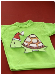
Iron on wrong side

Before the designs can be transferred the ink should be dry, otherwise the print could potentially smudge. This can take up to an hour depending on the ink used and the ambient conditions.