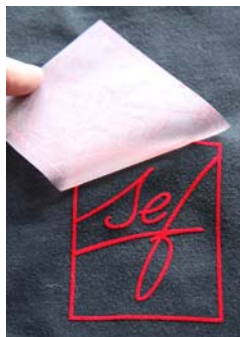
Remove liner, done!

The VelCut Fashion Series has 13 current designs.